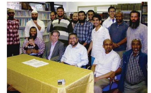
Assunnah Muslim Association contract signing.

Contract Scope: 10,000 sf replacement building, divided into three units, with the same parking/site plan layout as the original building.