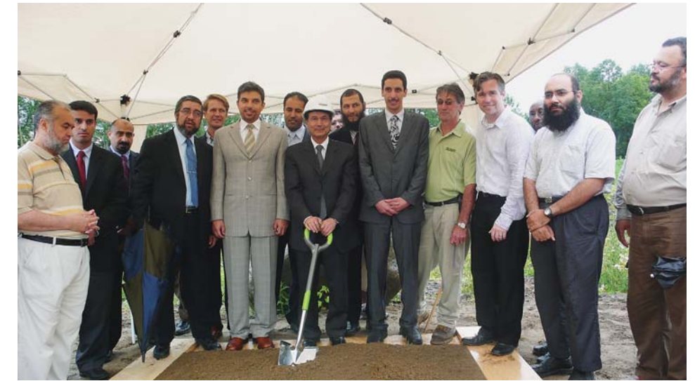
Ground breaking ceremony for the Assunnah Muslim Association’s Islamic Center, with the Ambassador of Kuwait.